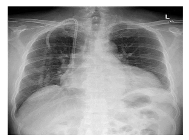
Figure 1 : Chest radiograph showing the right subclavian catheter prior to planned removal