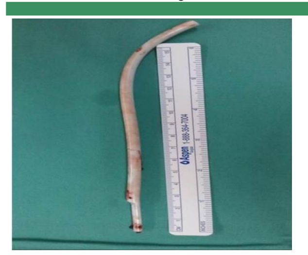
Figure 4 : The fractured retained part of the catheter after being completely retrieved in one piece