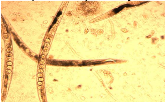
Figure 1: Adults female S. stercoralis worm with eggs and rhabiditiform Larvae obtained from agar plate (Magnification 40X)

The free-living adults were observed after five days of culturing in agar plate culture. In some cases, the eggs were hatched and the rhabditiform larvae were clearly visible inside the body of adult female worms after keeping the plate for seven days which shows S. stericoralis is not only oviparous but also it is larviparous (Fig. 1). In addition, all stages of the life cycles (eggs, rhabditiform larvae, filariform larvae and adult stage) were observed in the present study from a single agar plate culture after keeping the plate for seven days at room temperature (Fig. 2).