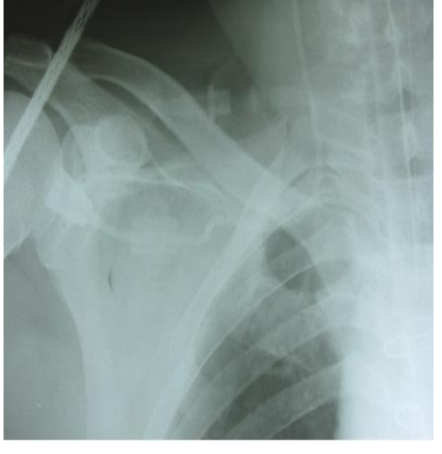
Figure 1: Central vein cathter going up to cerebral vein

although he was drowsy. On the twelve postoperative day, he opened his eyes and was able to obey commands; however, he was not able to move his left arm. The patient was extubated on 15^{\text{th}} the day of operation. History of thrombophelebitis, age, young sub-acute presentation, focal neurologic sign and its rapid recovery urged to reconsider a MRI venography and thrombophilia test for detection of cerebral veins pathology. Complete blood count and blood biochemistry were within normal limits, except for prolonged erythrocyte sedimentation and areduced protein C and S level. The protein C level was 35% (normal: > 70), and protein S level was 55 % (normal: 65%). There were no abnormal values of antithrombin III, lupus anticoagulant, and anticardiolipin antibodies. The other tests such as HLA-B5, HLA-B27, anti-nuclear antibody and rheumatoid factor were also negative. Three months follow-up revealed reduced protein C-S levels. MRI venoghraphy on the 18th day of hospital stay revealed thrombosis of cerebral dural vein with typical delta sign, effacement of brains sulcui and edema, but infarction or hemorrhage was not observed (Figures 2,3). Further course of the patient in the hospital was uneventful.